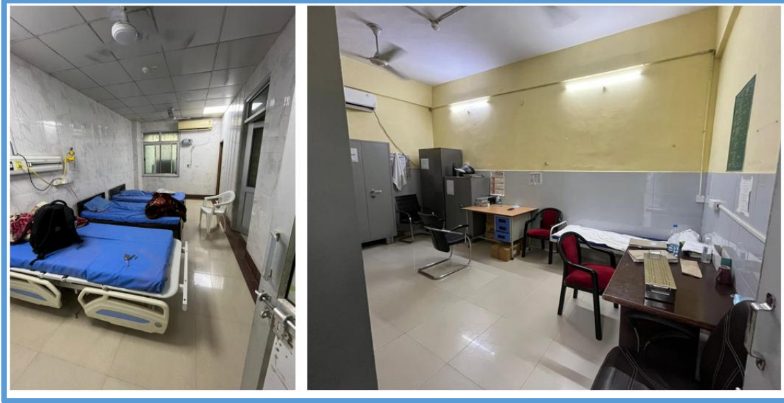
Residential areas, during posting of students for community learning, in urban health centers