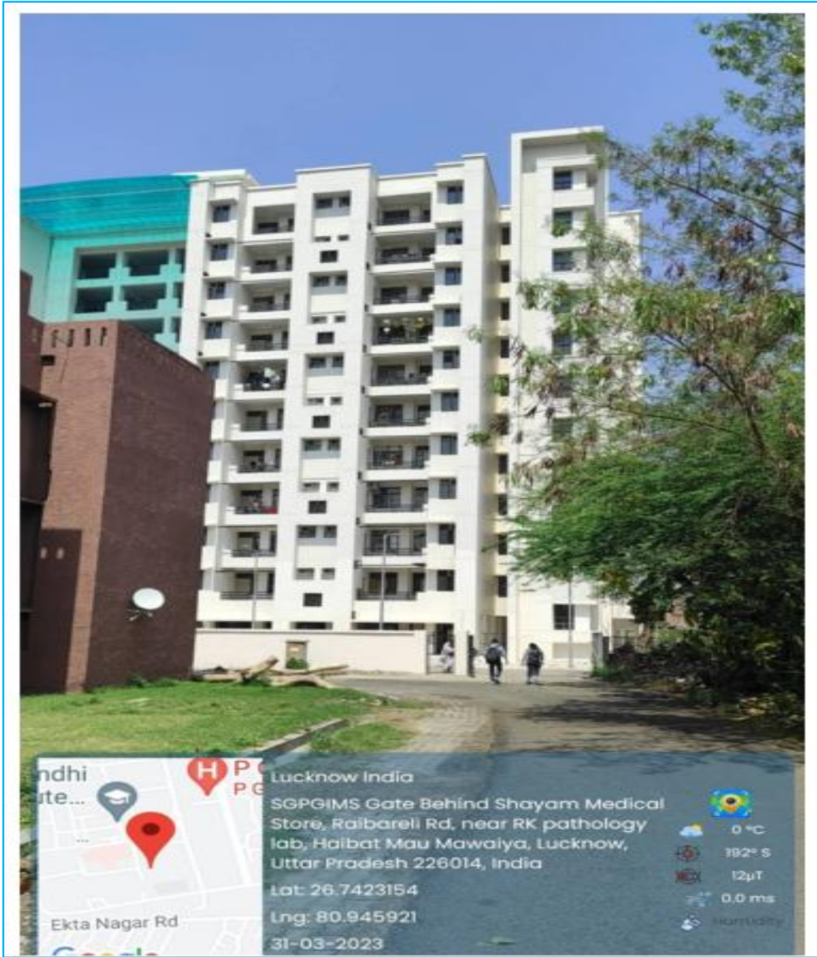
Multi-storeyed unmarried hostel for resident doctors