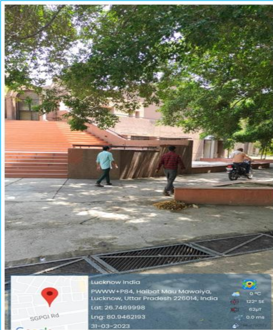
Old PG hostels for resident doctors