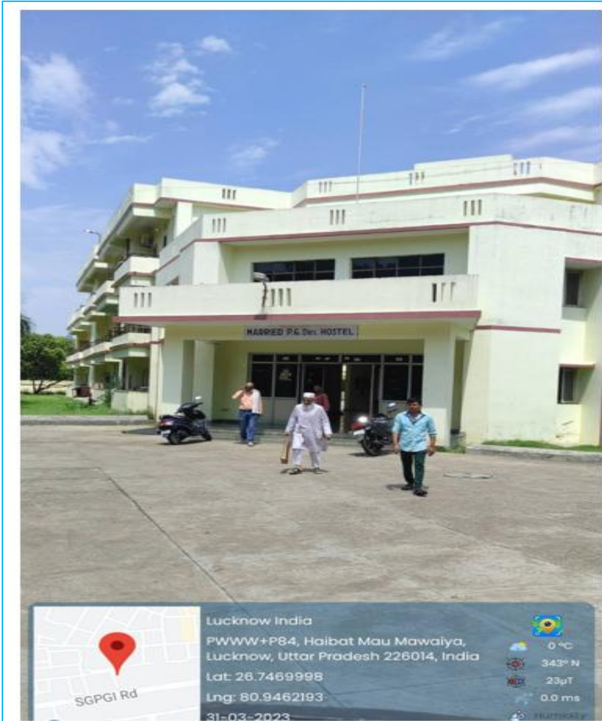
Married hostel for resident doctors